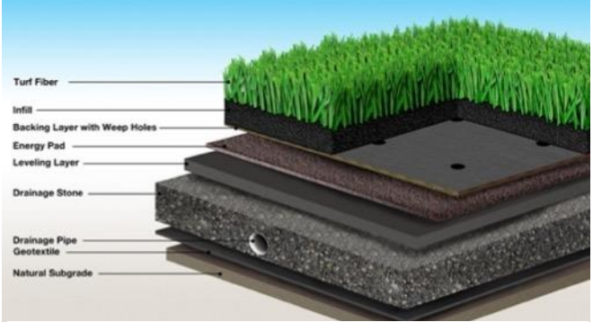
Illustration 1: Artificial Turf Counsel

As a landscape cover, artificial turf provides a low maintenance, weed-free surface that doesn't need to be watered or fertilized (however irrigation can be necessary for some infill materials).