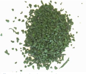
Illustration 3: Limonta Sport X-Tre

The elastic granule is advertised as having high use durability: Excellent resistance against UV, ageing, and wearing trample, no dust on the field, and high stability<sup>59</sup>. The rubber is fibrillated in the granulation and the supplier states that better bond is obtained in the filler material and spreading as well as splash is minimized compared to traditional SBR infill. The minimization of spreading has been observed with control measurements on field sides, but there is no scientific proof yet<sup>60</sup>.