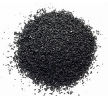
Illustration 2: Genan Fine SBR

Because artificial turf is typically dark and does not vaporize water, the surface can reach temperatures up to 20-30°C higher than for natural grass with measurements as high as 70° C on a 40° C summer day.<sup>27</sup> The rubber has a distinct smell that is especially predominant in hot weather; the smell can be suppressed by irrigation – which also reduces the temperature of the field<sup>28</sup>.