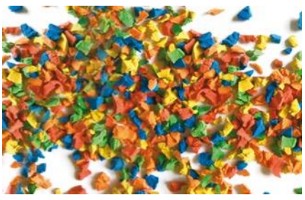
Illustration 5: Gezofill

EPDM is a generic term and the source, formulation, and quality of the material can vary greatly<sup>111,112</sup> with only limited possibility for a layman to see the difference<sup>113</sup>. Cowi reports in 2012 that the quality of rubber granulates based on EPDM differs: Good quality EPDM is well suited for use in artificial turf, but some suppliers use a lot of chemical fillers or recycled EPDM, which can cause the rubber granulates to crumble, resulting in poor quality granulates. Only (expensive) testing of the granulate can show the quality<sup>114</sup>.