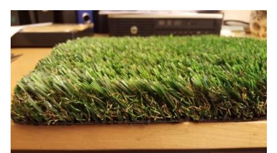
Illustration 7: Sport Vest Trinidad

Prices for the DOMO products are 160 NOK/m2 for the 20 mm carpet and 190 NOK/m2 for the 25 mm carpet.